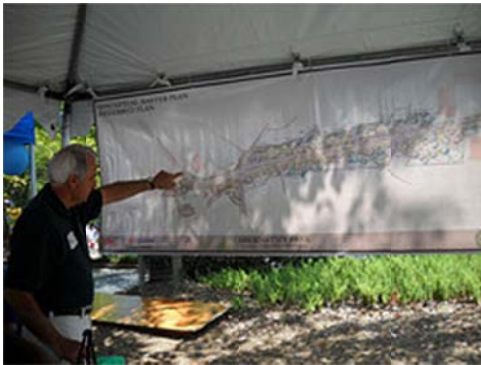
Sandy Springs Conservancy Board Member views plans for the Abernathy Greenway