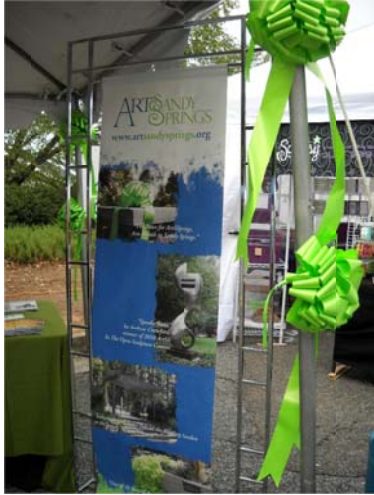
ArtSS booth at the Sandy Springs Festival attracted many visitors!

View our recent photos from the Sandy Springs Fall Festival and please share your photos with us!