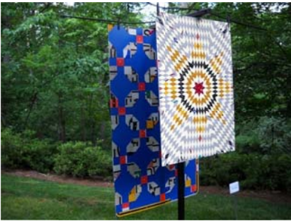
Quilts and Sheets

Visit the Sandy Springs Library Lawn to view the ongoing display of our 2008 and 2010 winners of the ArtSS Sculpture Contest. While four of the sculptures have been donated to the City of Sandy Springs by Art Sandy Springs, five amazing sculptures by well-known, talented artists are now for sale. Purchase one for your home, your business, or your favorite charity today! More information is available at the Library.